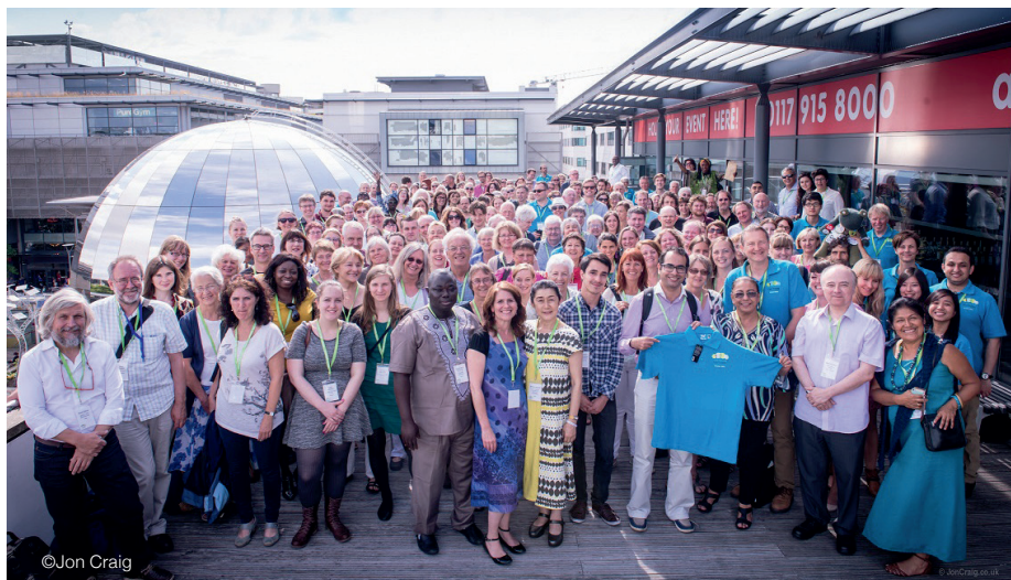
9th International Fair Trade Towns Conference, 2015