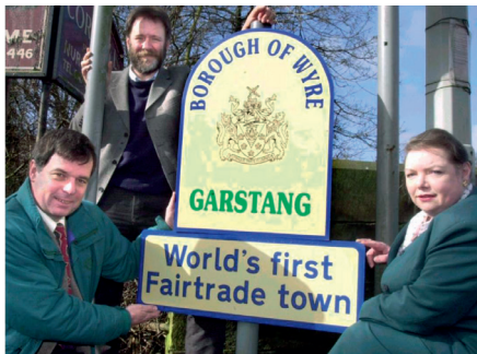
Garstang in Lancashire, UK, world's first Fair Trade Town, November 2001.

The municipality of Traun (23.000 inhabitants) was the winner of the second category. Traun is indeed very active in awareness-raising around the topic of Fair Trade. In particular, it won the award, because it bought Fair Trade Polo T-Shirts to dress three out of four of its staff members. The Jury welcomed this very significant engagement, given the size and possibilities of the municipality.