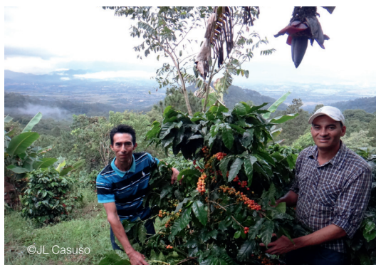
Working at CONACADO, Dominican Republic

Fair Trade is a very new concept in the Philippines. Awareness is still very low. However, local government have been carrying out some of the Fair Trade principles. In particular, each province, city and municipality in the Philippines annually celebrate a festival to help local craftsmen and producers to directly sell their goods to consumers. Often, this is also where they meet foreign traders who will eventually export their products. In the Bicol Region (south of Manila), they have an activity dubbed as "Meeting people behind the products" which combines tourism with local production creating links between producers and consumers. This initiative enables consumers, including tourists, to gain understanding on the social and environmental costs of their consumption. This likewise exerts pressure on producers and traders to provide safe and healthy working conditions for the workers.