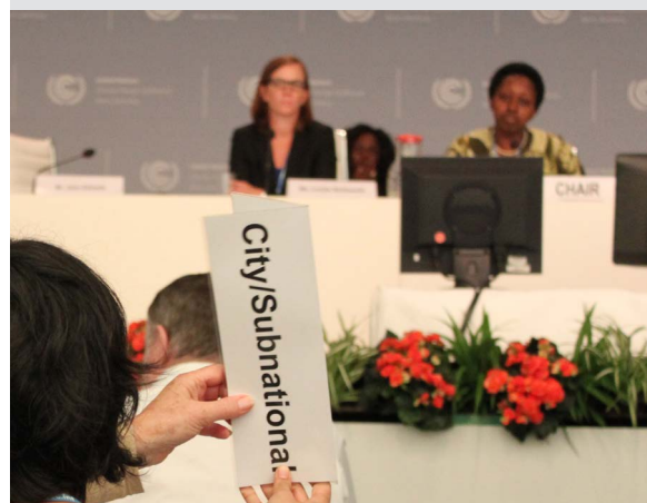
Representative of cities and subnational governments interacting at the UNFCCC