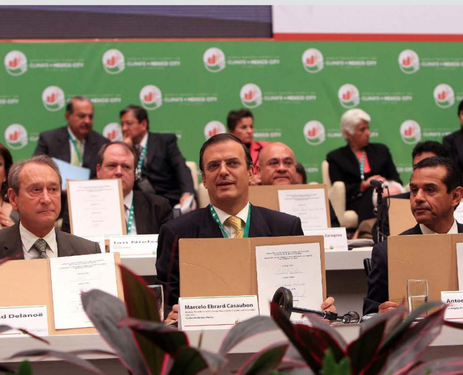
2010 - Launch of the Mexico City Pact