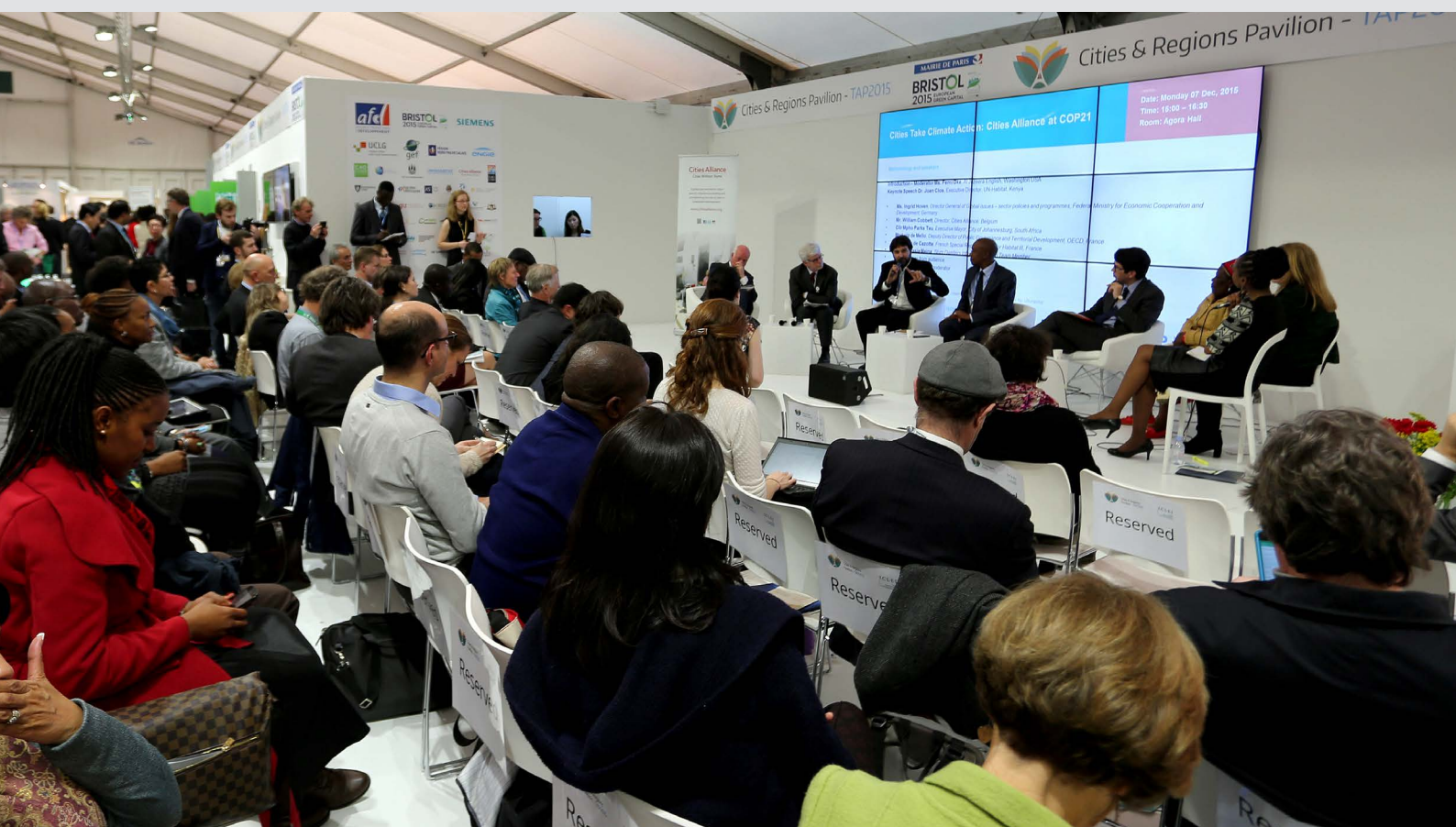
The Cities & Regions Pavilion – TAP2015 at COP21 in Paris

The steps outlined above are essential steps that enable local and subnational governments to support the implementation of the Paris Climate Package. There are, nonetheless, additional actions cities can and should take in order to strengthen climate action while enhancing their overall sustainability. The following table provides a snapshot of actions linked to a number of climate-related action areas, designed to guide cities and regions in pursuing integrated action.