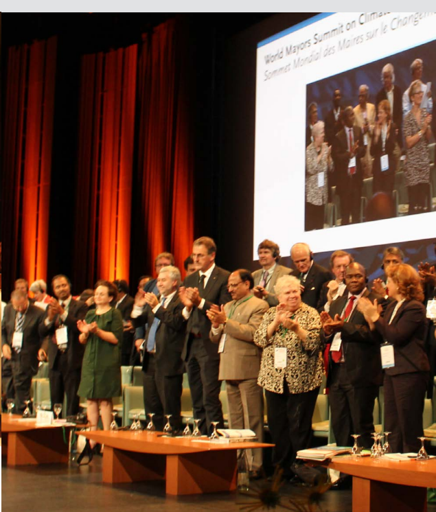
2013 - Adoption of Nantes Declaration