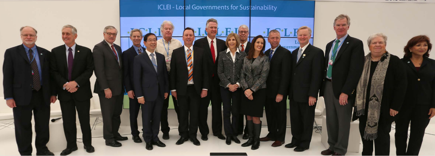
Leaders of ICLEI Members in the United States with ICLEI President and Mayor of Seoul Park Won Soon at the Cities & Regions Pavilion – TAP2015 at COP21 in Paris

The Climate Summit for Local Leaders in Paris City Hall, hosted by Anne Hidalgo, Mayor of Paris, and Michael Bloomberg, the United Nations Special Envoy for Cities and Climate Change, convened the largest ever gathering of mayors, local leaders and governors focused on climate change. The historic event empowered local and subnational governments to set more ambitious targets, demonstrated the collective power of local action and helped ensure the voices of local leaders were reflected in the climate negotiations.