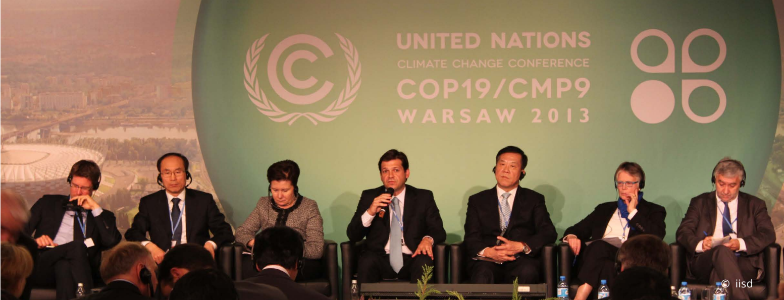
2013 - Ministerial-Mayoral session on Mitigation at COP Presidency Cities and Subnational Dialogue of COP19 Cities Day

and learning opportunities, tools, guidebooks and advocacy.