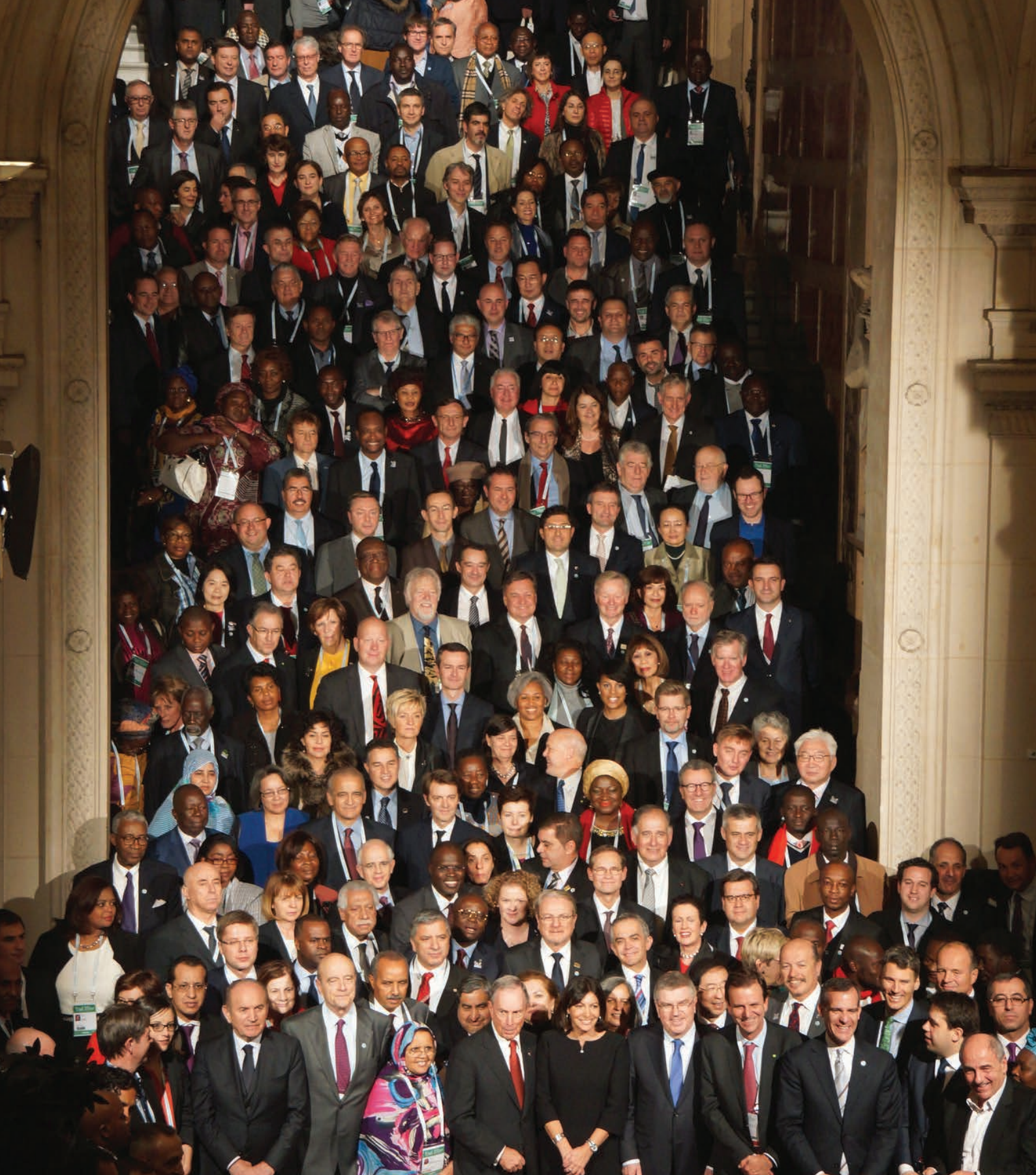
Family photo at the Climate Summit for Local Leaders in Paris City Hall in 2015