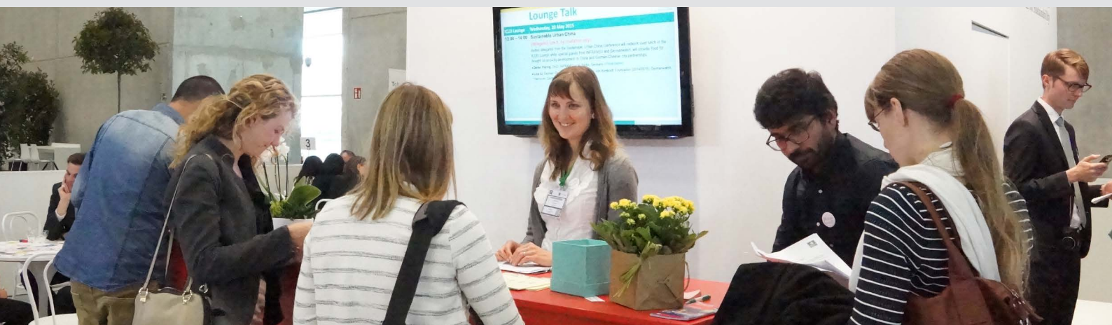
ICLEI at Metropolitan Solutions 2015 in Berlin, Germany

Accelerator: Reflecting the high demand from cities to collaborate with private sector partners, ICLEI has developed CiBiX to accelerate city-business collaboration for sustainable urban development. ICLEI acts as a bridging entity by providing matchmaking services and neutral