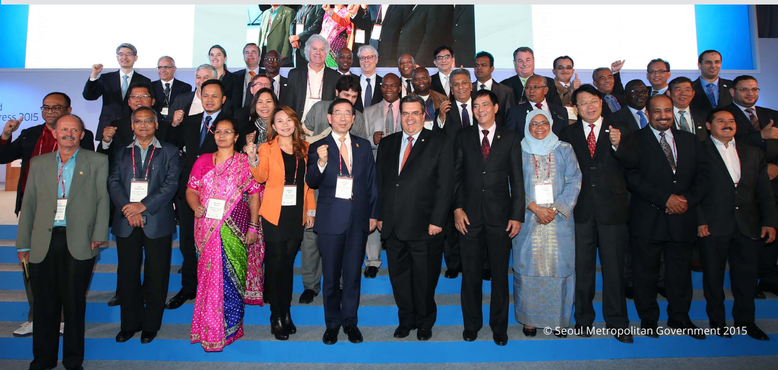
ICLEI leaders committing to the Compact of Mayors at the ICLEI World Congress 2015 in Seoul, Republic of Korea