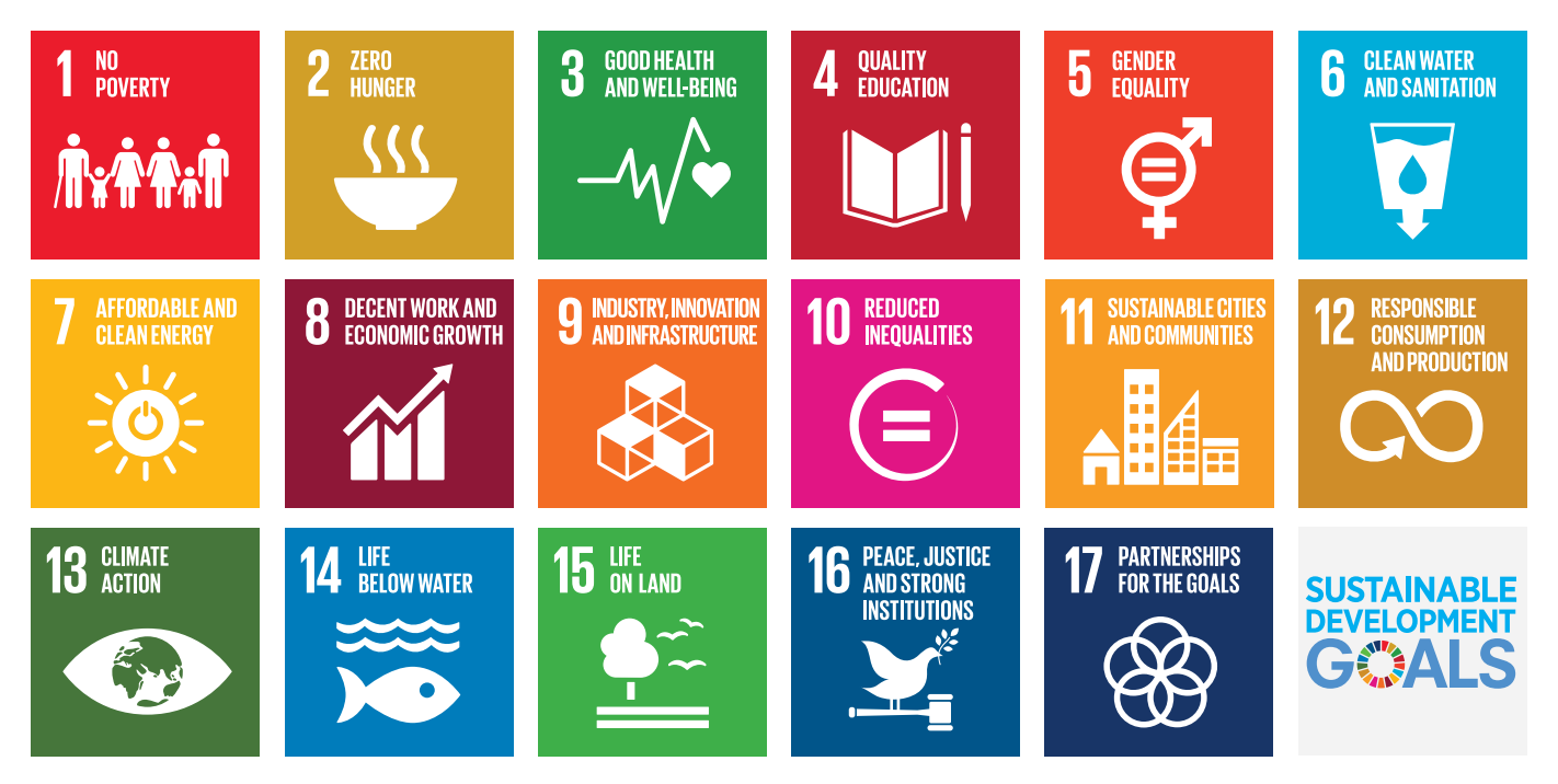
FIGURE 2: THE SUSTAINABLE DEVELOPMENT GOALS (SEE APPENDIX A FOR FULL DESCRIPTION OF THE GOALS)