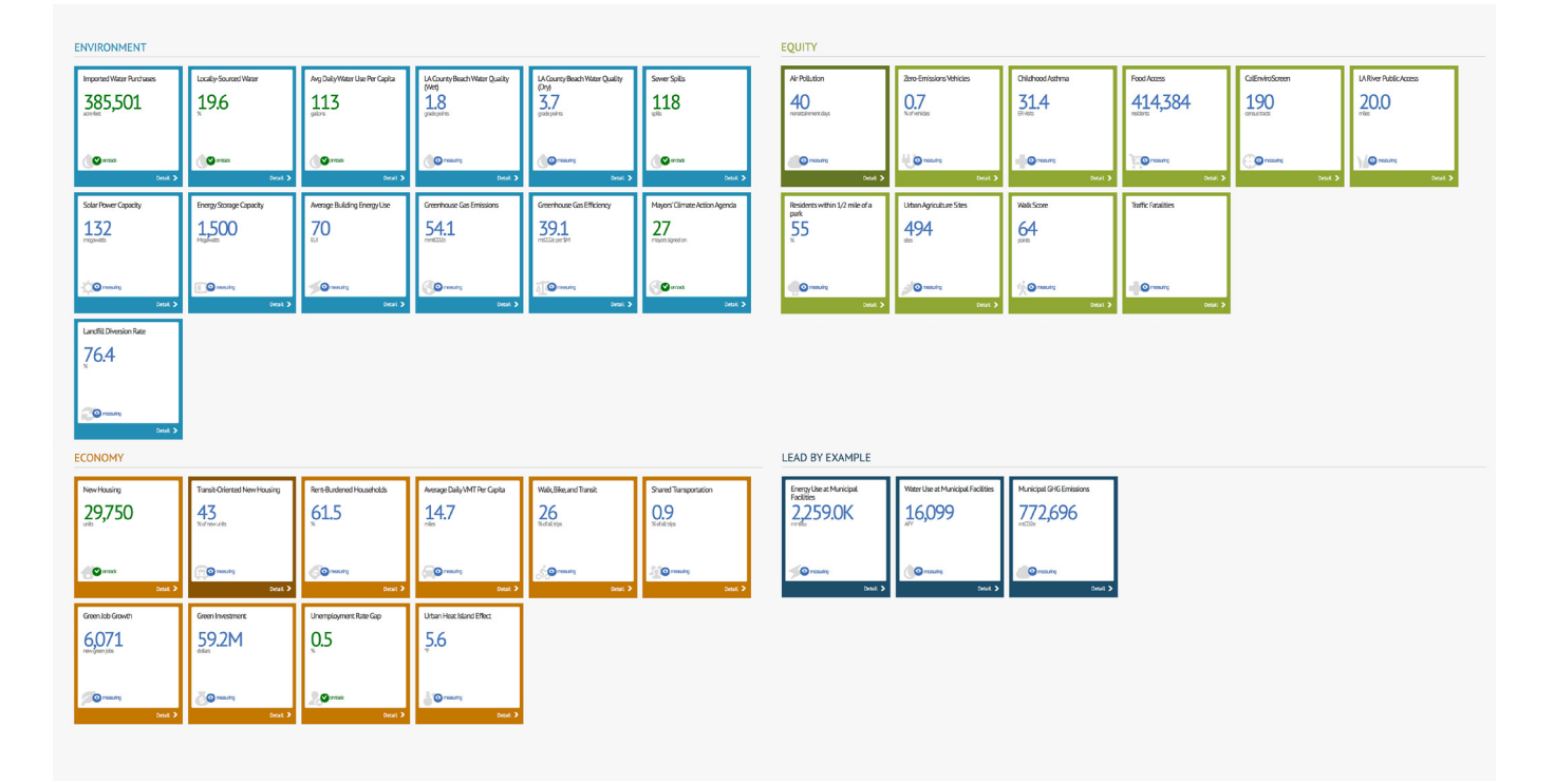
FIGURE 3: SCREENSHOT OF L.A.'S SUSTAINABLE CITY PLAN DASHBOARD

It is clear that resources will be needed if San José wishes to aggressively pursue goals related to sustainable development and it is also clear that those resources cannot be provided exclusively by City Hall. A multi-sector effort, including private sector partners and civil society organizations, will be essential.