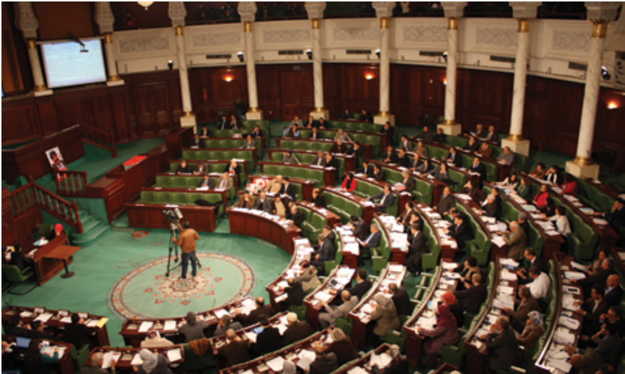
UNDP Tunisia Debates of the Tunisian Constitution, 20th January 2014.

Ideally, proposed draft laws dealing with development-related issues will explicitly identify whether and how they support Agenda 2030 and specific SDGs and their targets. This could be included in the explanatory memorandum to the draft law and in the speech introducing the draft law. Currently, however, this is not common practice. To address this, parliaments themselves may wish to commission an SDG Impact Analysis from their own parliamentary secretariats to identify how the proposed draft law impacts on SDG achievement. Alternatively, the rules of procedure can be amended to require the sponsor of the law to produce such an analysis when the draft law is introduced. Some countries already undertake socio-economic, environmental, and gender impact assessments of draft laws. Lessons learned indicate that such a process can be systematized through the adoption of a simple checklist, which can then be applied by the parliamentary secretariat to each draft law produced for consideration. Parliamentarians can then use this information to identify areas for amendment.