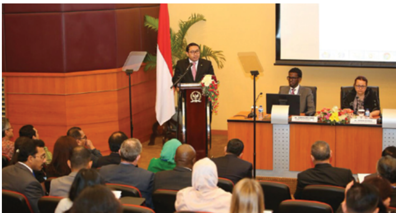
Regional Workshop on Parliaments and SDGs, 30 to 31 August 2016, Jakarta, Indonesia.

It is important for parliaments and parliamentarians to know that they are not alone in their efforts to monitor SDG implementation to achieve key development objectives. Many regional and global organizations work to promote the achievement of one or more of the SDGs. Some of these groups may already be engaged with your parliament; if not, they can be engaged to support the work of parliamentarians and parliament to build capacity and support your efforts to be a full and active partner in the implementation of the SDGs in your country.