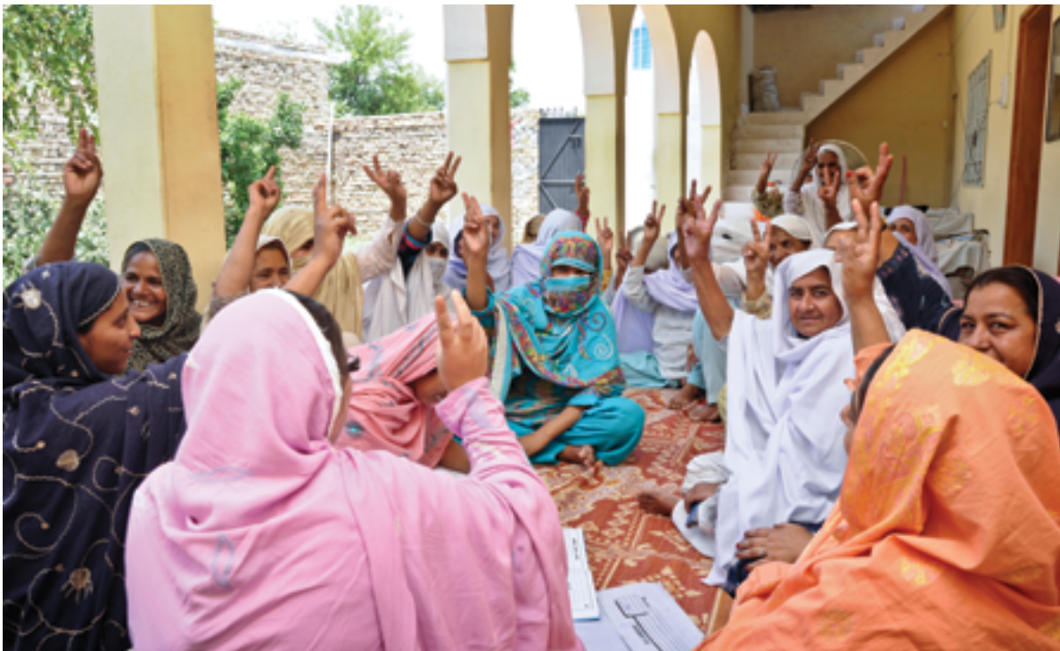
UNDP Pakistan Meeting of female community organization "Shamatanzeem" village "Padhana", and union council "Dheenda" of district Haripur. Discussing general issues.

Below are some ways that a parliament can take specific action to ensure SDG implementation is done in coordination with sub-national and local governments and with the input of people throughout the country.