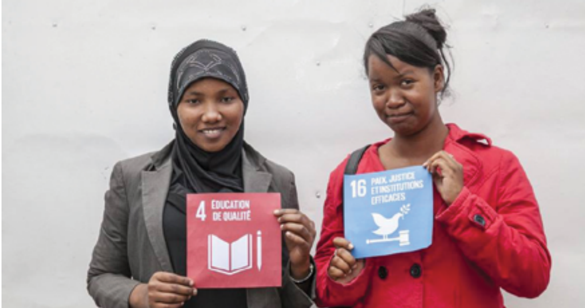
UNDP Madagascar Youth raise Global Goals at Social Good Summit in Madagascar on September 2015