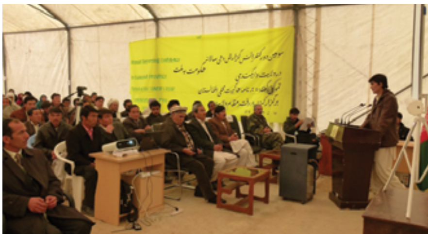
UNAMA Third Dai Kundi Annual Reporting Conference in Afghanistan on January 2012.

Public consultations: As noted in Section VI above, parliamentary committees should be engaging civil society and the public as they consider draft laws and conduct inquiries. Such consultations can range from the informal (such as public forums and reporting sessions) to the more formal (e.g., public hearings); and from the technical (e.g., surveys) to the simple (e.g., requests for submissions via SMS). Consultation can also come in the form of virtual engagement, including online feedback, surveys and social media.