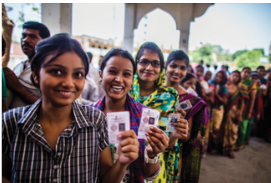
UNDP India India elections 2014.

tasking an existing committee to undertake a specific inquiry into an issue. If there is no committee with subject matter jurisdiction, or when an inquiry may require more dedicated resources, a parliament may also choose to establish an ad hoc or special committee with a specific, singular mandate to undertake an inquiry and then disband upon completion of its work.