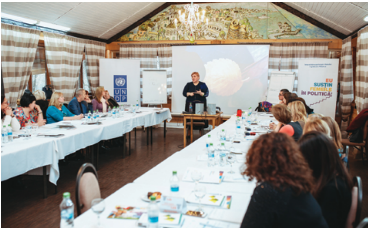
UNDP Moldova Parliament Secretariat pledges to promote a gender-responsive human resources management on 23rd November 2016.

To get from here to there, as mentioned earlier, all parliaments will need to build new capacities. Even if your parliament is actively engaging public and seeking their feedback through the work of members and committees; even if your parliament has the capacity to conduct in-depth research and has in place systems that allow people's voices to be actively expressed through parliamentarians; there will still be a need to reflect on how your systems must be retooled to ensure they will advance the 17 SDGs.