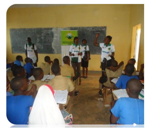
Volunteers of JADD at the GBHS Etoug-Ebe

As a challenge, JADD faced logistic and financial difficulties to the achievement of this activity. Thus a good number of sensitization programs need to be organised to prevent this contagious infection.