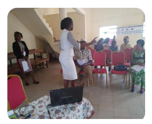
Formation of YA VI Council personels, CSOs members