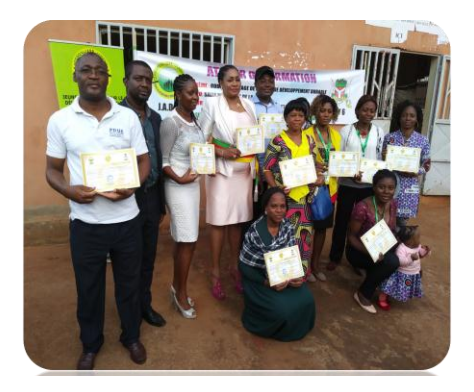
Family picture of the formation in Yaounde VI Council