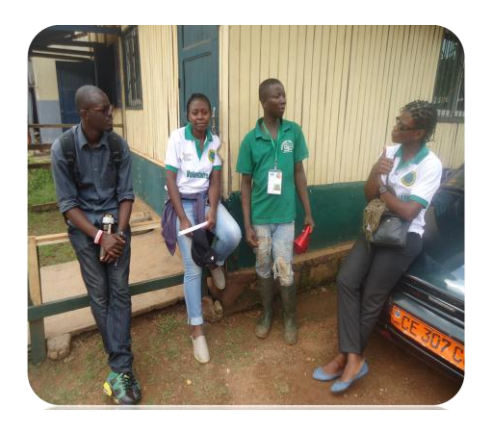
Exchange between JADD Volunteers and Dirts collectors of GIC LE VERT