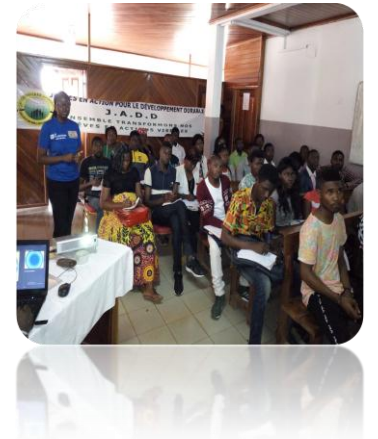
Volunteers in formation by the General Coordinator of JADD

As recommendation, it is important to multiply sensitization programs on the importance of volunteerism to build a sustainable nation.