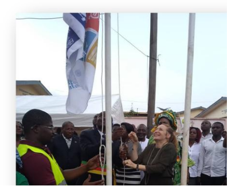
Hoisting of SDGs flag by the Mayor of YAC and the UN Representative