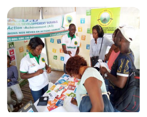
Volunteers of JADD IN action at Reunification monument