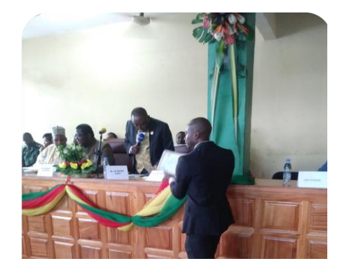
Presentation of the formation by JADD during CAD 3 municipal council