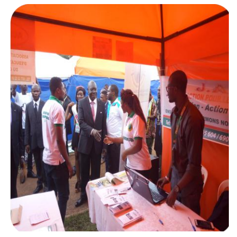
Visit of the Stand of JADD by the Minister of Youth and Civic Education at SIJ