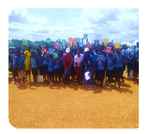
Family picture with the volunteers of JADD and the members of SD Clubs GBHS Balgong