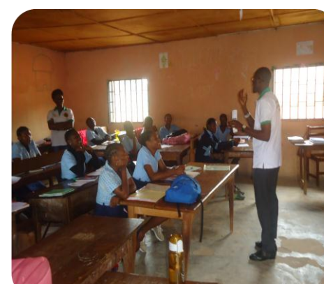
Volunteers of JADD at the College Jeanne Alegue Messi