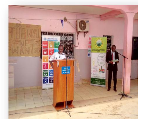
Official launch of SD Clubs in YAC by the Mayor