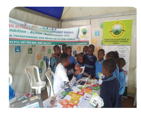
Sensitization of children on SDGs at the Reunification monument