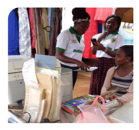
Sensitization of traders in Acacia's market by Volunteers of JADD

As a recommendation, more sensitization campaigns should focus on mobilization and creation awareness of women in Yaoundé 6 on the importance of SDGs and their role in achieving it.