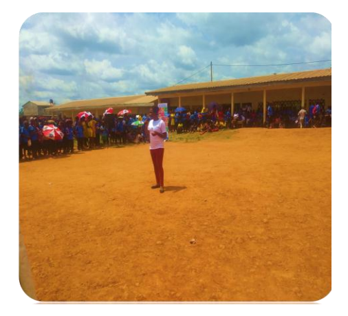
Sensibilization on SDGs at the GBHS Balgong by the SG of JADD