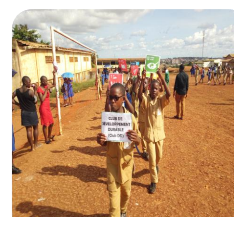
Match –pass of SD Clubs at the GBHS Etoug-Ebé