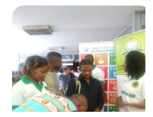
Sensitization at the French Cultural Institute in Cameroon