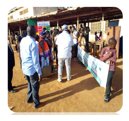
Sensibilization at the GBHS Etoug-Ebé