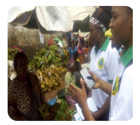
Sensitization of traders in Acacia's market by Volunteers of JADD