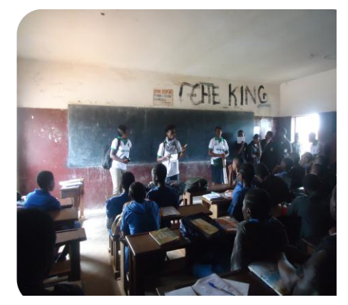
Volunteers of JADD at the GBHS Biyem-Assi