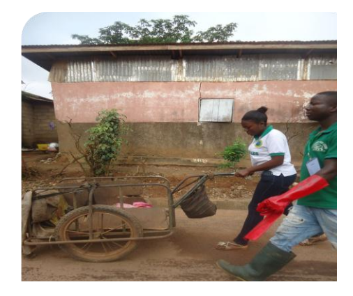
Transportation of waste to the trash bins