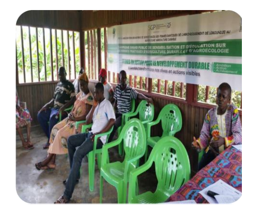
Beneficiaries at the formation

The project is in the second phase of implementation.