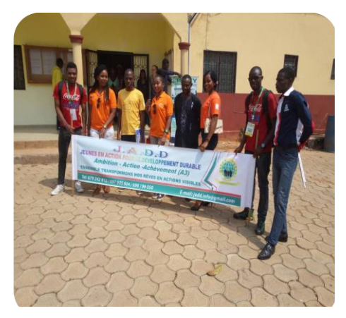
Sensibilization at the ISSTY University