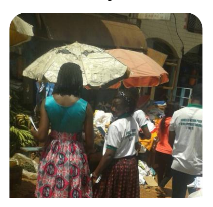
Sensitization of traders in Acacia's market by Volunteers of JADD