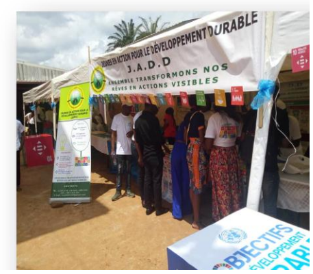
Visition of stand-by population

On September 25<sup>th</sup>, 2018, JADD together with the United Nations Development Program (UNDP) and the Yaounde 6 Council hoisted a flag that embodies the 17 Sustainable Development Goals (SDGs) and officially launched Sustainable Development Clubs. This symbolized the integration of SDGs in schools particularly at the primary level, Community Development Plan and the engagement of Civil Society Organizations (CSOs) to promote the 2030 agenda. This went a long way to initiate the relationship between the CSOs, national and international institutions. During this said activity, sensitization programs were carried out from the September 20<sup>th</sup> to 24<sup>th</sup> 2018 to create awareness in schools, markets, and along the streets within Yaoundé – Sub Division. More than 500 people within this Sub Division were sensitized. More than half of the sensitized population was not aware of the 2030 Agenda, thus more sensitization programs should be organized in order to inform the population about the global goals.