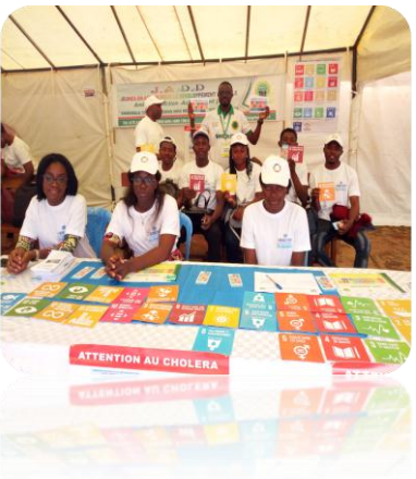
Volunteers sensibilizing on SDGs and activities of JADD